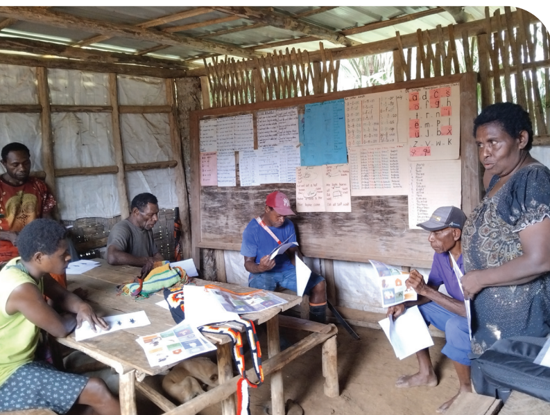
Image caption: Local fathers attend a discussion group to learn more about how to support their pregnant partners.

Thanks to the ongoing commitment of many valued philanthropic donors and our Research Action Partners, GROW will continue to expand its activities in the months ahead. Thank you!